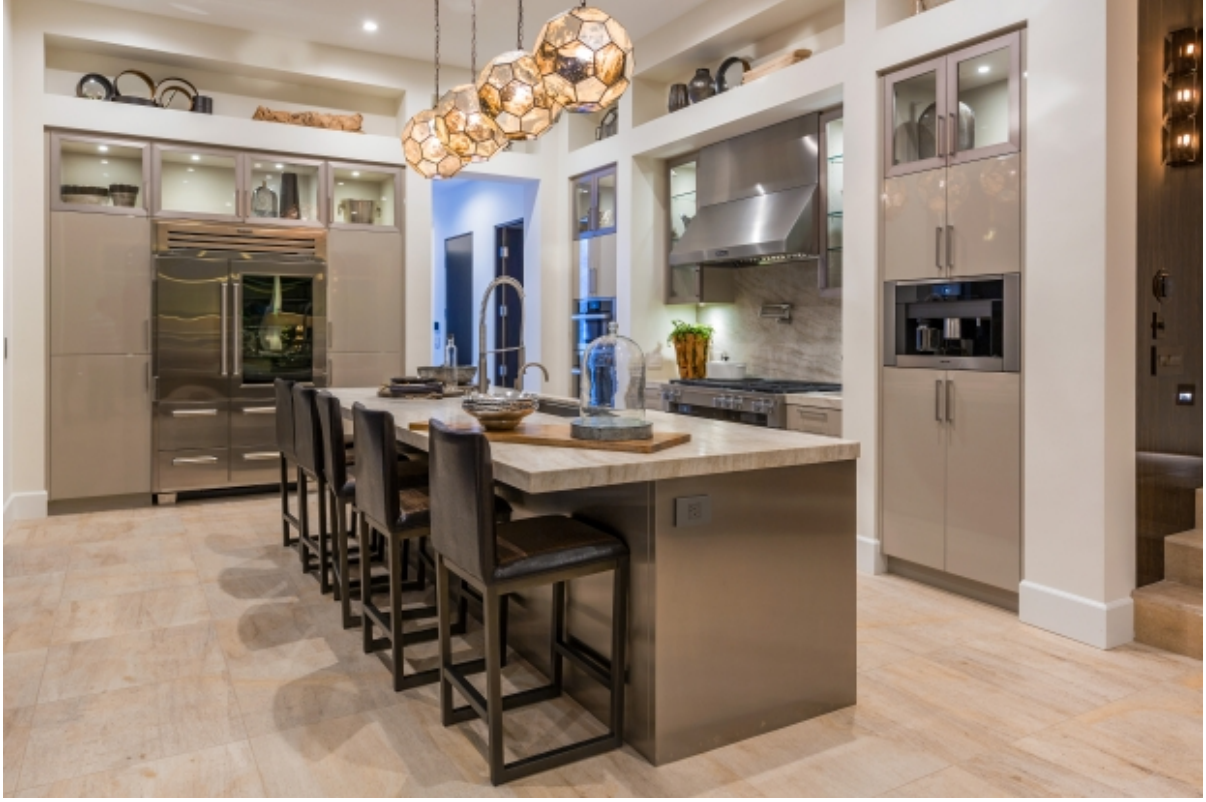
The top floor of each residence features an "Entertainer's Loft," a pair of flowing indoor and outdoor spaces with a bar (5900's at top) or kitchen in (5904, below).